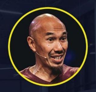
FRANCIS CHAN Church Planter and Bestselling Author